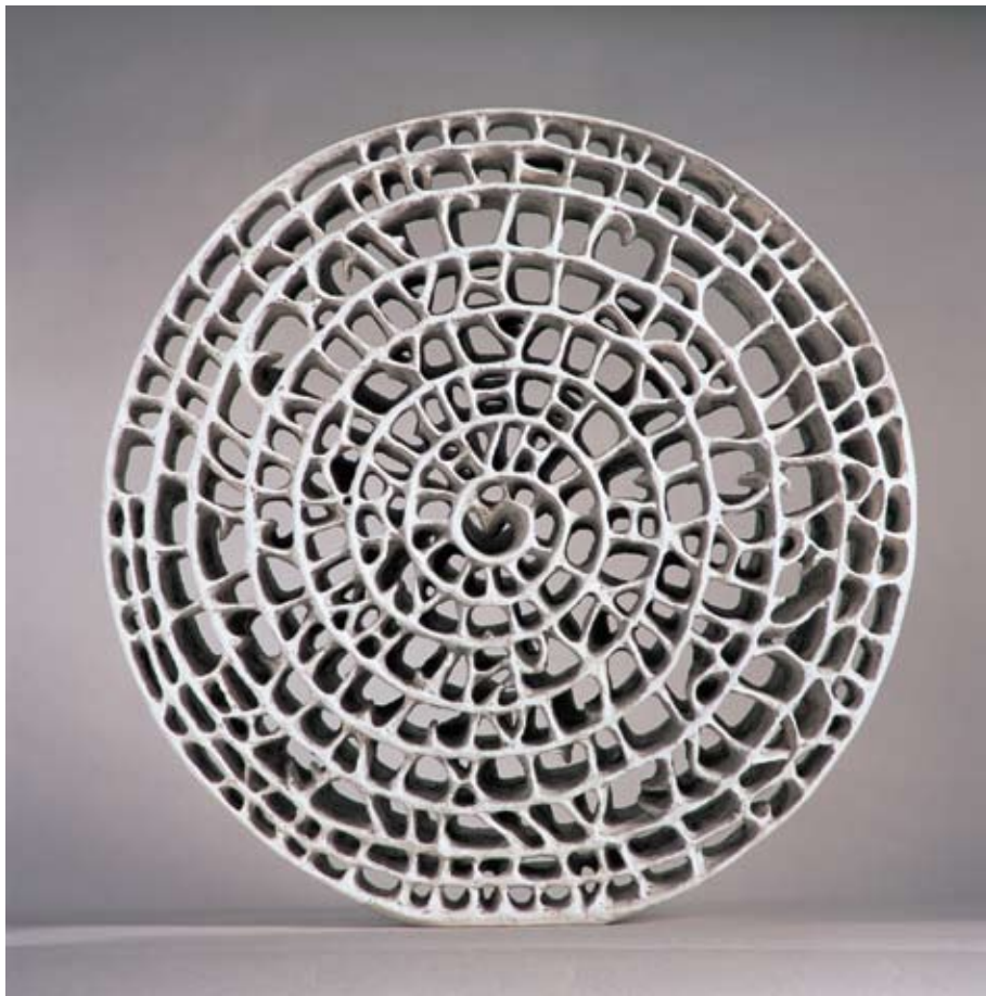
Spiral Wheel , 60 cm (24 in.) in diameter, ball clay with perlite and paper fibers, with white terra sigillata and stains, fired to 1135°C (2075°F) in an electric kiln, 2005.