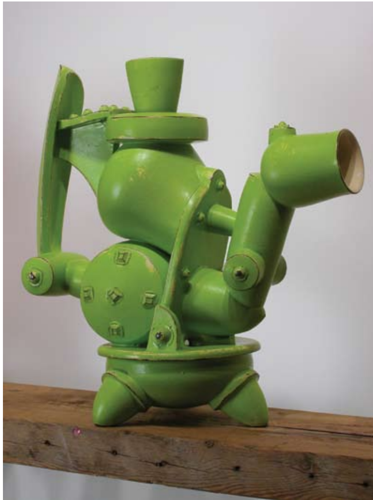
Green Industrial Teapot, 17" (43 cm) in height, stoneware with sign painter's paint.

W orking in ceramics was something I discovered in college. Watching my first instructor throwing pottery on the wheel was mesmerizing and something I just had to learn how to do. So my original aspirations to pursue graphic design gave way to ceramics... and all along I really wanted to be a fine arts major anyhow. Over the next few years, I earned both my BFA and MFA in ceramics, and continued on to residencies, one at the Archie Bray for two years and a second one at The Clay Studio in Philadelphia. At these residencies, I shifted from making functional pottery to developing my current sculptural style. I have sold work since my undergraduate days but I have never relied on these sales completely. Teaching has been my main income since leaving gradu-