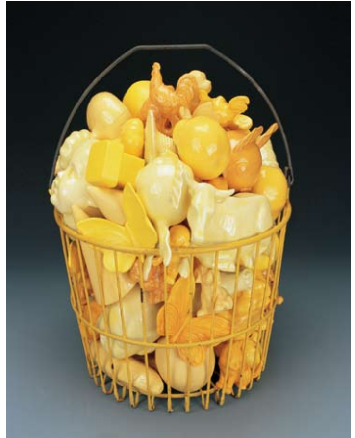
Yellow is Betrayal , 22 in. (56 cm) in height, slip-cast white earthenware, fired to cones 06 and 04, with metal egg basket, 2004.