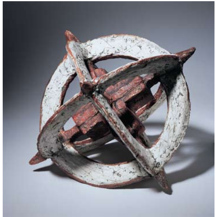
Spheres with Cross , 27 cm (11 in.) in diameter, ball clay with perlite and paper fibers, 2002.

And no doubt, Åberg is extremely conscious of form. Yet her work is never devoid of content. More of a sculptor than a potter, she creates objects of great depth and long lasting impression.