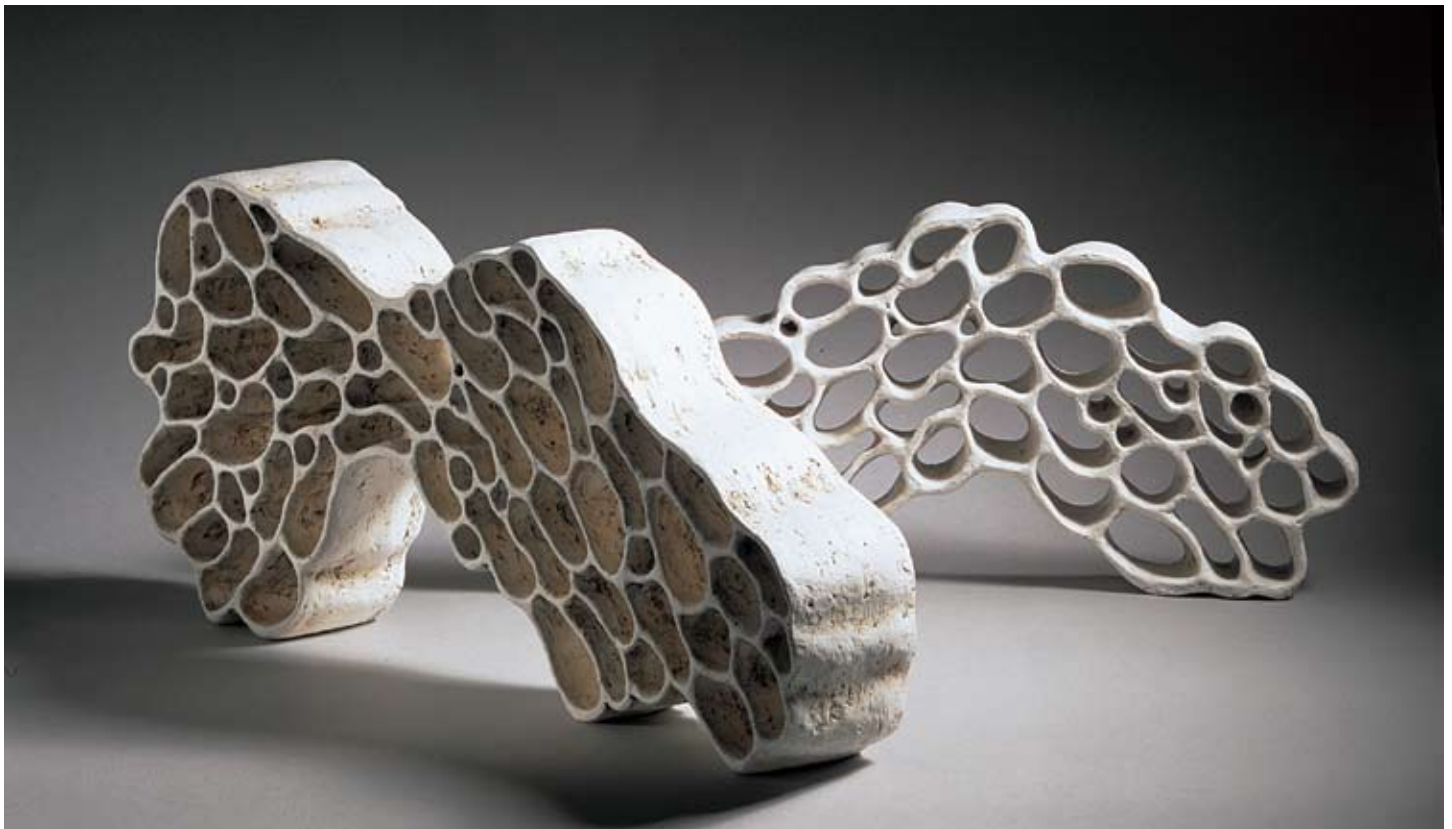
Flow I and Flow II, 65 cm (26 in.) in height, ball clay with perlite and paper fibers, 2003 and 2004.

"I felt a freedom with this new material," Åberg said. "I could do all kinds of things that I couldn't do with ordinary clay. I started working very expressively. I didn't want to control things too much. Perhaps I needed to liberate myself from my time at art school. I started to use bright commercial stains and acrylic paint, I built solid pieces, used cardboard boxes and filled them up with clay, and I