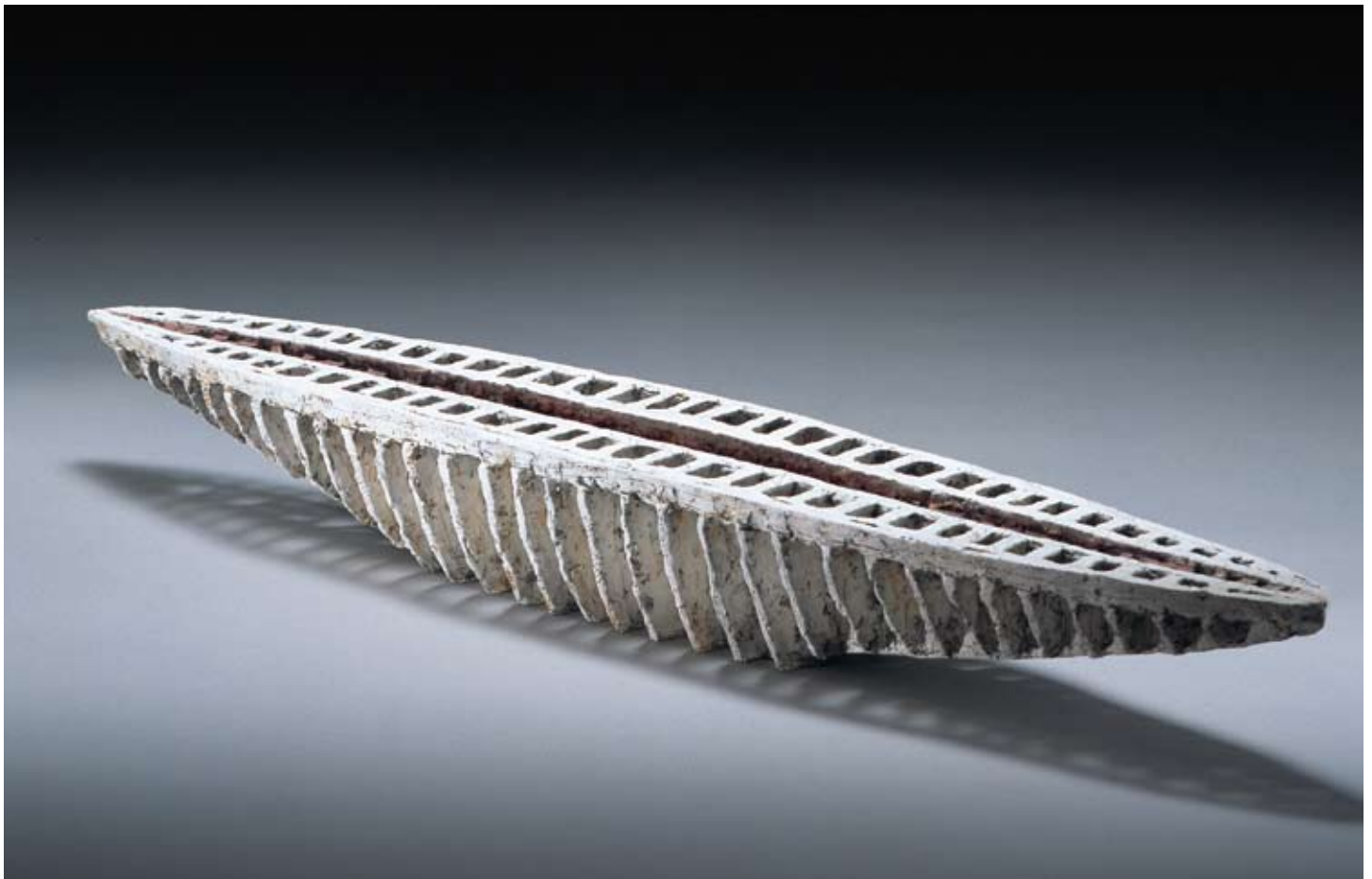
Cargo , 110 cm (43 in.) in length, ball clay with perlite and paper fibers, 2002, by Barbro Åberg, Ry, Denmark.