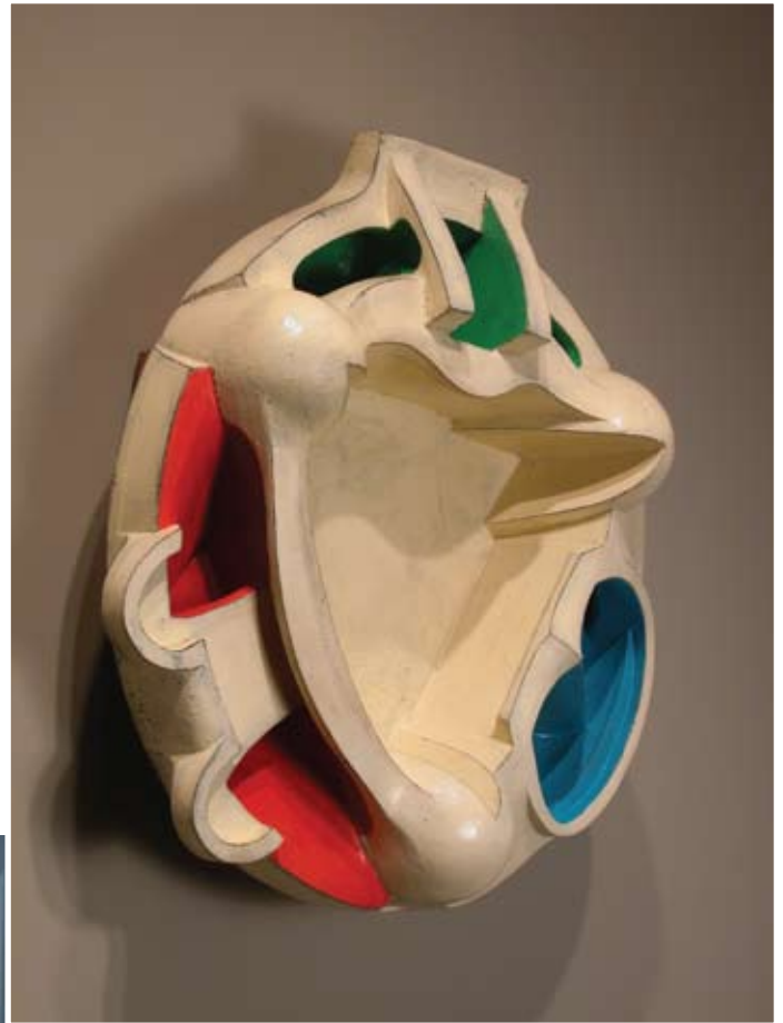
Above: Platter-Form #7 , 28" (71 cm) in height, stoneware with sign painter's paint.

I knew from very early on that I wanted to work in the arts. I don't expect to make much money from my work, just enough to have a studio space and time to make the art first and foremost. If my day job can be related to this work, so much the better. I do my best to teach students in basic handbuilding and throwing techniques and to encourage them as much as I can. I know how much things can stack against them. It is their own continuing interest that they will have to rely on to keep making art.