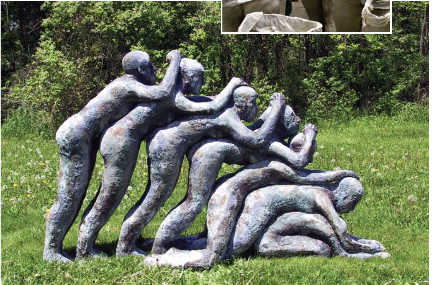
Below: Child pose , 58 in. (147 cm.) in height, handbuilt, crater glaze, fired to cone 6.