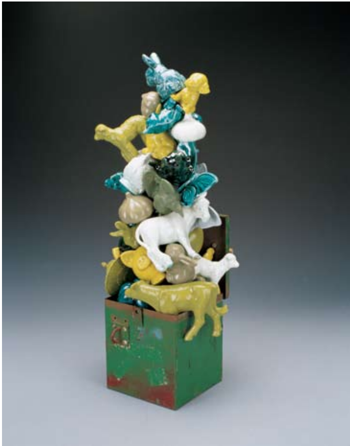
Green is Balance , 28 in. (71 cm) in height, slip-cast white earthenware, fired to cones 06 and 04, with metal ammunition box.