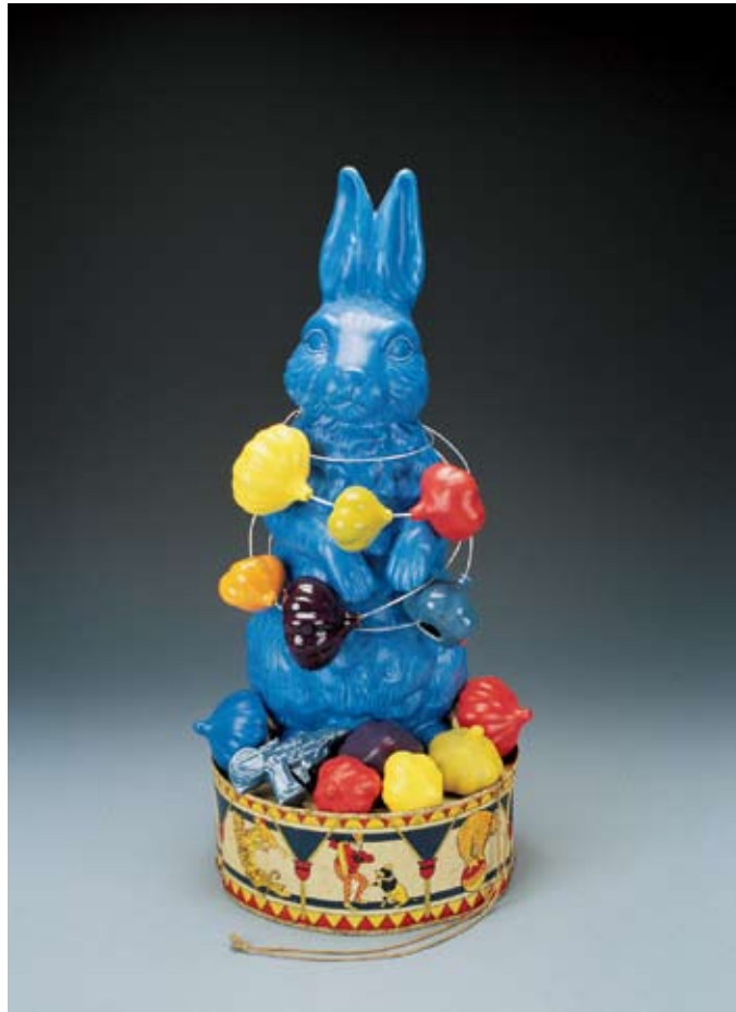
Blue Rabbit with Garlic Necklace , 21 in. (53 cm) in height, slip-cast white earthenware, fired to cones 06 and 04, with toy drum, wire, 2004.