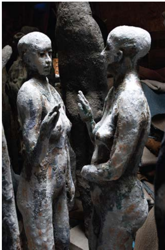
Detail of Peace , handbuilt, crater glaze, fired to cone 6.

I also have a small group of friends that I can bounce ideas off of. We meet once a month for a show and discuss what we are working on. Mostly, inspiration comes down to going into the studio everyday and trying to figure out what I can do that is new but won’t be